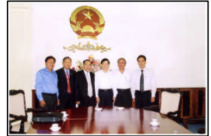
President of Vietnam Nguyen Minh Triet learns of the OFOC project.

YOU CAN HELP: We highly value the help of our current volunteers, supporters and donors. In addition to them, we will be needing help from more experts in renewable resources (e.g. solar electric, wind, micro-hydro, geothermal, biogas); childcare, business management, economics, community design, computers, networks, telecommunications; non-profit accounting; architecture; engineering; cause marketing; board members, advisory board members, fund raisers and more. Please contact our nonprofit NGO if you believe this is a worthwhile project that you would like to help as a volunteer or donor.