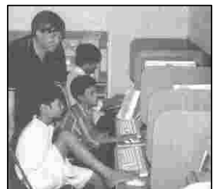
Child born with no arms learning to use his foot to control the computer mouse